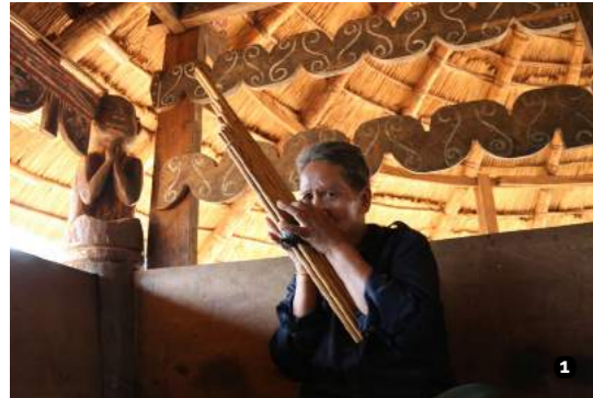
1. Playing the Khaen 2. Carved coffin 3. Katu woman wearing traditional dress in Kakndone