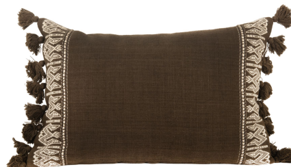
TAI LUE NAGA YAI LUMBAR