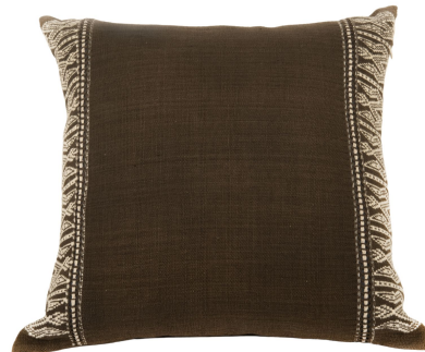
TAI LUE NAGA YAI SQUARE

The Tai Lue are accomplished in a range of traditional arts, including weaving, architecture, and silversmithing. We work with many of the artisans in Nayang Tai Village where the women are master cotton producers, weavers, and natural dyers. These Naga Yai cushion covers are jumbo versions of our traditional Naga collection.